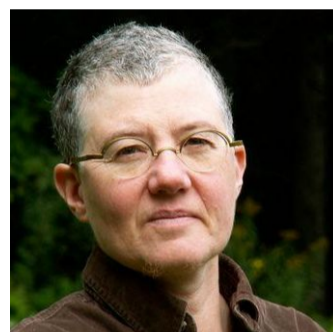
Tina Minkowitz Center for the Human Rights of Users and Survivors of Psychiatry

This webinar is an opportunity for those advocating for the human rights of older people in the UN OEWG process to learn lessons from other UN human rights processes. With contributions from experts in the human rights of people with disabilities and the women's rights movement, this webinar will explore the following shared issues: